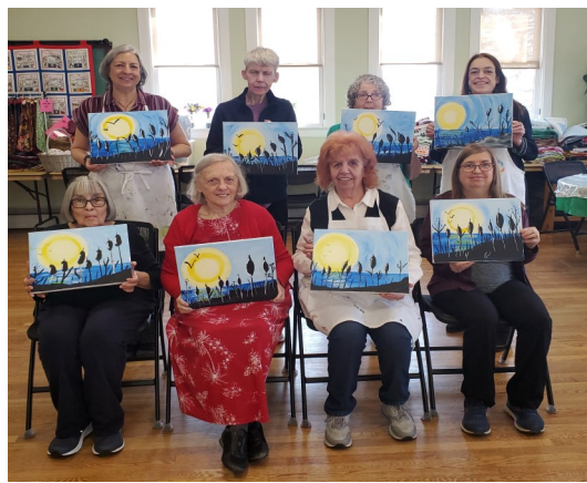
Friday, June 2nd at 1:00 p.m. $15 per person— All materials provided— Come to the office & vote on which picture you'd like to paint!